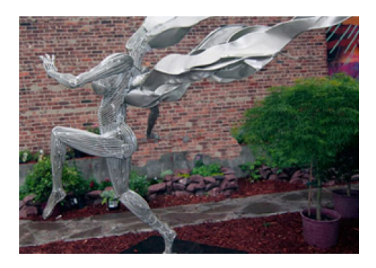
Valkyrie Sculpture Brooklyn, NY