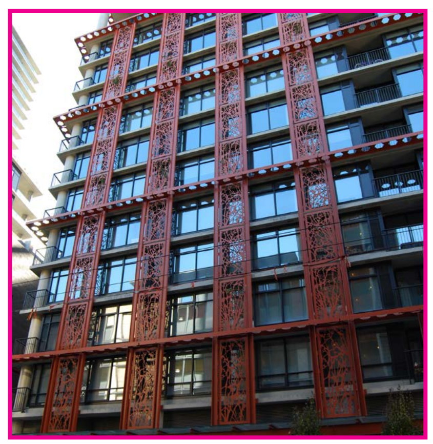
The Woodwards Building W Tower in British Columbia utilized a duplex system of powder coating over hot-dip galvanized steel to protect its exposed decorative steel elements from corrosion without detracting from the building's aesthetics.