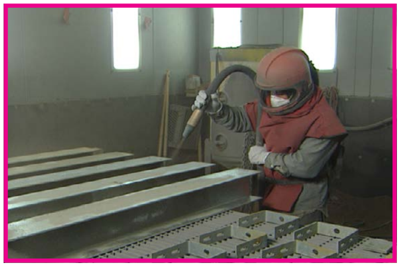
Sweep blasting is the preferred method of profiling because of the soft nature of the zinc surface.