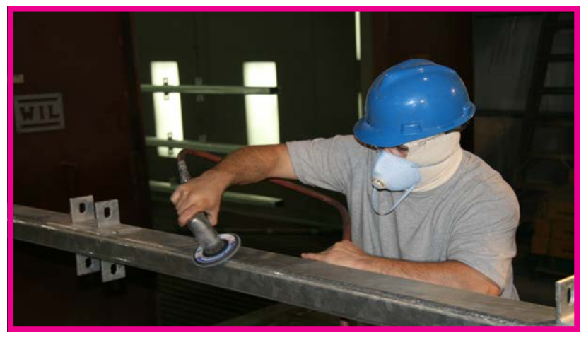
Grinding roughens the surface to make a good anchor for the powder application and adherence.

The final method of profiling galvanized surfaces is to grind the surface to be powder coated. The grinding will roughen the surface to make a good anchor profile for the powder application and adherence. A removal of up to one mil is acceptable, but the grinder should not be applied with enough force to completely strip the zinc coating. Afterwards, the surface should be blown off with compressed air. In some atmospheric conditions, such as high humidity, temperature, etc., the formation of zinc oxide on the surface will begin very quickly, so powder coating should be applied immediately. Zinc oxide formation is not visible to the unaided eye; therefore, in any atmosphere, powder coating should be started as soon as possible after surface preparation.