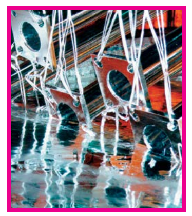
It is important to correctly determine the condition of the galvanized surface to be powder coated.

Whether bright or matte, the key factor in the newly galvanized condition is a lack of zinc compounds on the surface, which simplifies the cleaning. Some newly galvanized parts, those with a matte gray, can have a rough surface texture, while bright and shiny parts are often smooth. Regardless if the surface is rough or smooth, profiling the surface by sweep blasting is necessary to ensure the adherence of the powder coating.