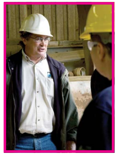
If notified, the galvanizer can avoid galvanizing processes that could inhibit powder coating adhesion.

Communication between the fabricator, specifier, powder coater, and galvanizer is vital before galvanizing. The various parties may desire special handling or require alterations to the design to facilitate the galvanizing process and/or the application of the powder coating. Furthermore, if the galvanizer is aware the part will be powder coated after galvanizing, precautions can be taken to avoid processes that may interfere with the powder coating adhesion.