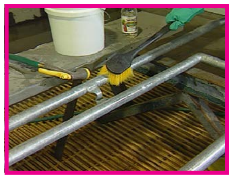
Organic contaminants can be removed using alkaline or acidic solutions, or solvent cleaning.

Finally, solvent cleaning, applying solvents to the surface using a clean cloth, can be used. The cloth will pick up the organics, so it must be changed often to avoid re-depositing them onto he galvanized surface.