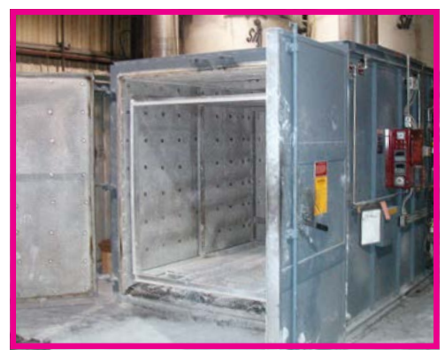
Ovens are used to bake galvanized steel prior to powder coating to prevent outgassing.

After the galvanized surface has been cleaned and profiled, the part is ready for the next step, baking. This step is extremely important to prevent pinholes and blisters in the powder coating, commonly known as outgassing. Water and air molecules can be trapped in the zinc coating and must be removed through the baking process. The part should be thermally treated in an oven to remove residual moisture prior to powder application to reduce pin-holing and blistering. The temperature