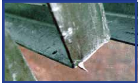
Sharp icicles created during the galvanizing process must be filed off.

The first step requires the removal of any excess zinc produced when withdrawing the steel from the zinc bath. Small bumps and runs can cause concerns if the part is to be painted. As the steel is lifted out of the bath, the liquid zinc drains back into the kettle; however, at times the liquid zinc does not drain quickly enough and freezes to the surface or edge of a part. A run is excess zinc that freezes along the part, and a drip is excess zinc that freezes as it falls off the edge of the part, creating an icicle-like zinc spike.