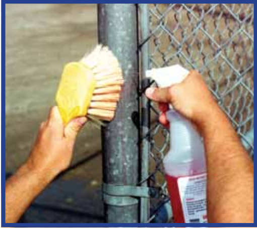
Organic contaminants can be removed using alkaline or acidic solutions, or solvent cleaning.

Once the galvanized surface is smooth, step two involves removing all organic contaminants from its surface. Organic contaminants can be removed with an alkaline solution, acidic solution, or solvent cleaning. A mild alkaline solution, a mixture of ten parts water and one part alkaline cleaner, can remove all organics from the surface without damaging the galvanized coating. The alkaline solution can be brush applied or used with a power washer; however, if power washing the pressure must be held below 1450 PSI to ensure the zinc coating is not damaged.