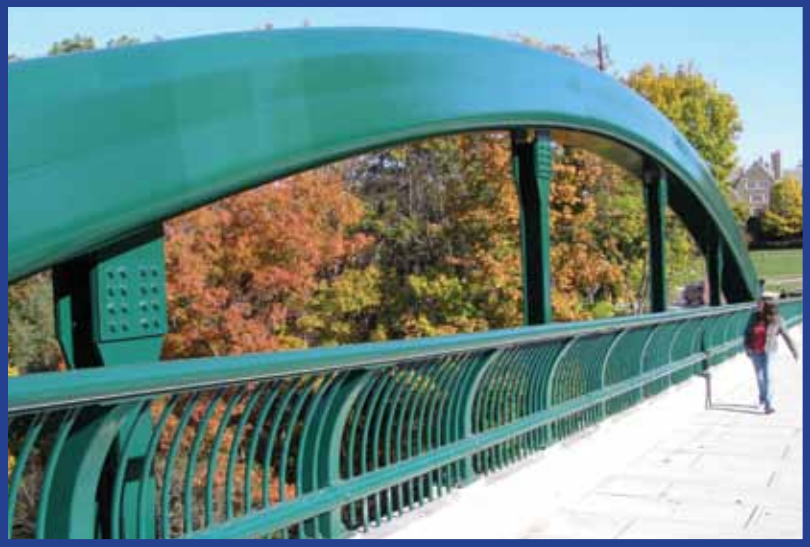
The Thurston Avenue Bridge utilizes a duplex system of paint over hot-dip galvanized (HDG) steel for corrosion protection

Duplex systems, or painting over hot-dip galvanized steel, have been used for decades as a means to enhance corrosion protection. Painting over hot-dip galvanized steel provides the owner/specifier with effective corrosion protection, while still allowing the structure to be painted for color or aesthetic reasons. Duplex systems are becoming increasingly common and popular because of this combination of benefits.