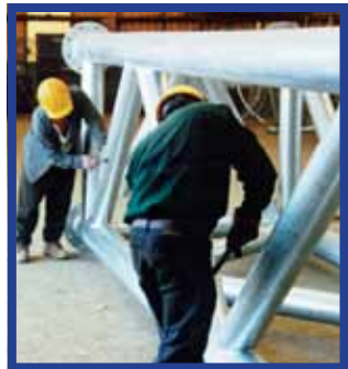
Workers prepare the surface of a galvanized structure for paint by filing off any bumps, runs, or drips created during the galvanizing process.

Successfully painting over hot-dip galvanized steel is relatively simple. Just like painting on any other surface, proper surface preparation is key to creating an effective bond between the paint and the galvanized surface. Galvanized steel requires slightly different preparation steps according to the surface condition. Thus, proper preparation relies on correctly identifying the galvanized surface condition, and then following the appropriate cleaning and profiling steps to achieve optimum bonding of the paint to the hot-dip galvanized steel. For detailed instruction on preparing the surface, refer to ASTM D 6386: Practice for Preparation of Zinc (Hot-Dip Galvanized) Coated Iron and Steel Product and Hardware Surfaces for Painting .