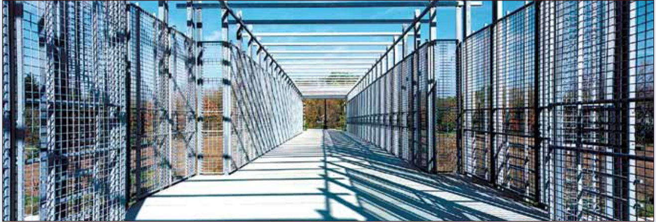
Chanhassen Pedestrian Bridge, Chanhassen, Minn.

Specifiers select steel corrosion protection systems from a variety of different coatings, each with a unique set of characteristics. Those characteristics include method of application; adhesion to the base metal; corner, edge, and thread protection; and coating hardness, density, and thickness. All affect the corrosion protection system's applicability for the project. As well, each coating system must be evaluated for the relative economics and expected service-life.