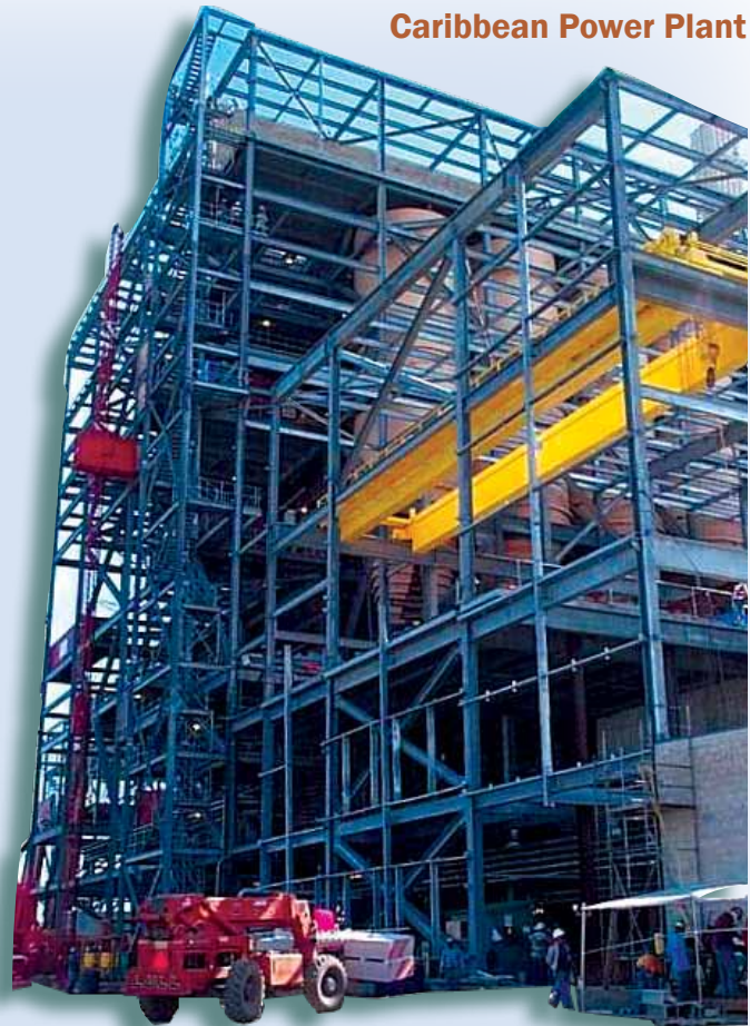
Caribbean Power Plant

The galvanizer encouraged the engineer and owner to consider not only the initial cost data, but also the life-cycle cost data for the originally specified shop primer and field topcoat paint system and the two-coat shop-applied system.