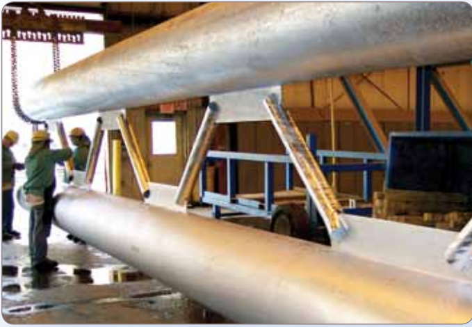
A galvanized coating can be applied independent of inclement weather conditions.