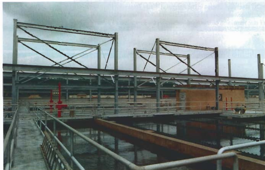
Aspinwall Water Treatment Plant under construction in 1989. HDG steel columns support the steel roof truss in the clarifier building.

Aspinwall Water Treatment Plant (Pittsburgh, Pennsylvania) (Figure 3). Harsh chemicals added to the clarifier (chlorine, alum, lime, and permanganate) accelerate corrosion of unprotected steel. A 1997 inspection of the galvanized steel measured 5 mils (127 \mu m) of zinc—enough to last at least 50 more years (Figure 4).